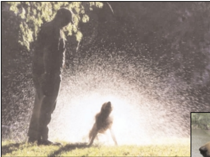
Tom Pool demonstrates the benefits of a Golden on a hot Summer Day

This section will be available for any dog pictures or pictures of club members.