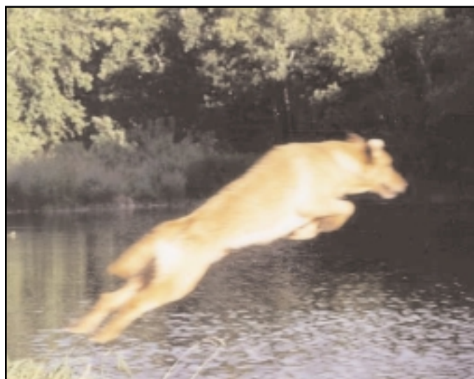
Don Best's dog Bean with a wonderful water entry!